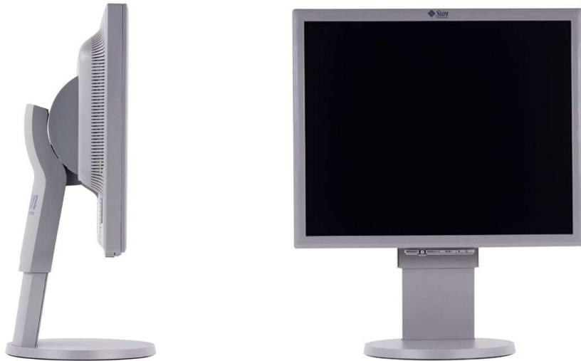
Figure 3. Sun's 19-inch Flat-Panel TFT-LCD Digital Monitor