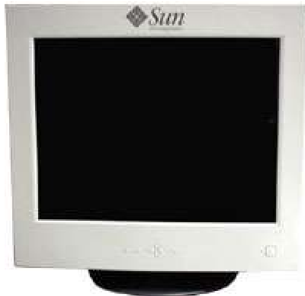
Figure 2. Sun's 21-inch CRT Monitor