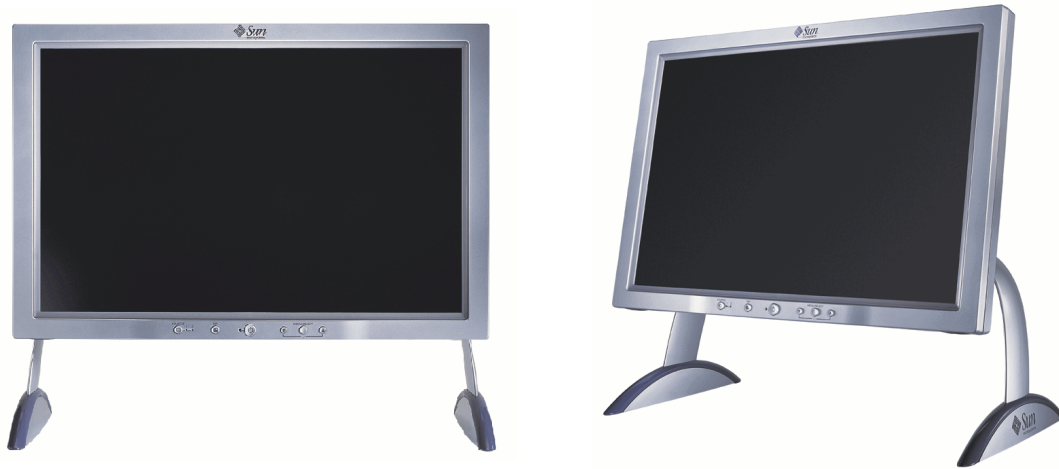
Figure 4. Sun's 24.1-inch Flat-Panel TFT-LCD Digital Monitor