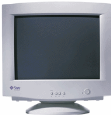
Figure 1. Sun's 17-inch CRT Monitor